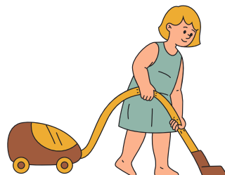
vacuuming the floor