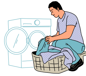
doing the laundry