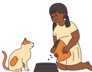
feeding the cat