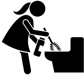
scrubbing the toilet