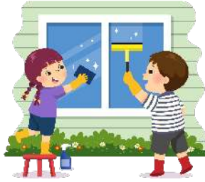
cleaning the window