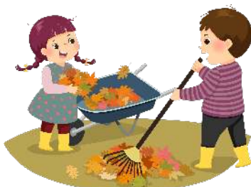
raking the leaves