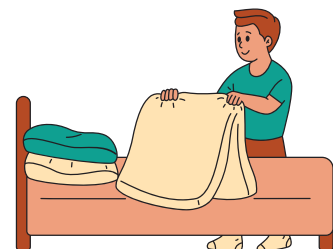
making the bed