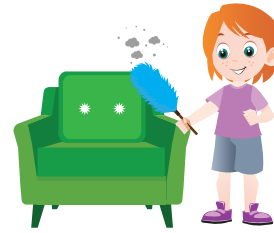
dusting the furniture