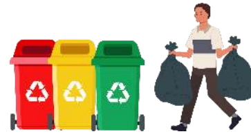
taking the rubbish out