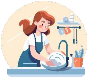
washing the dishes