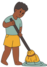
mopping the floor