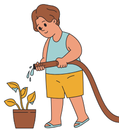
watering the plants